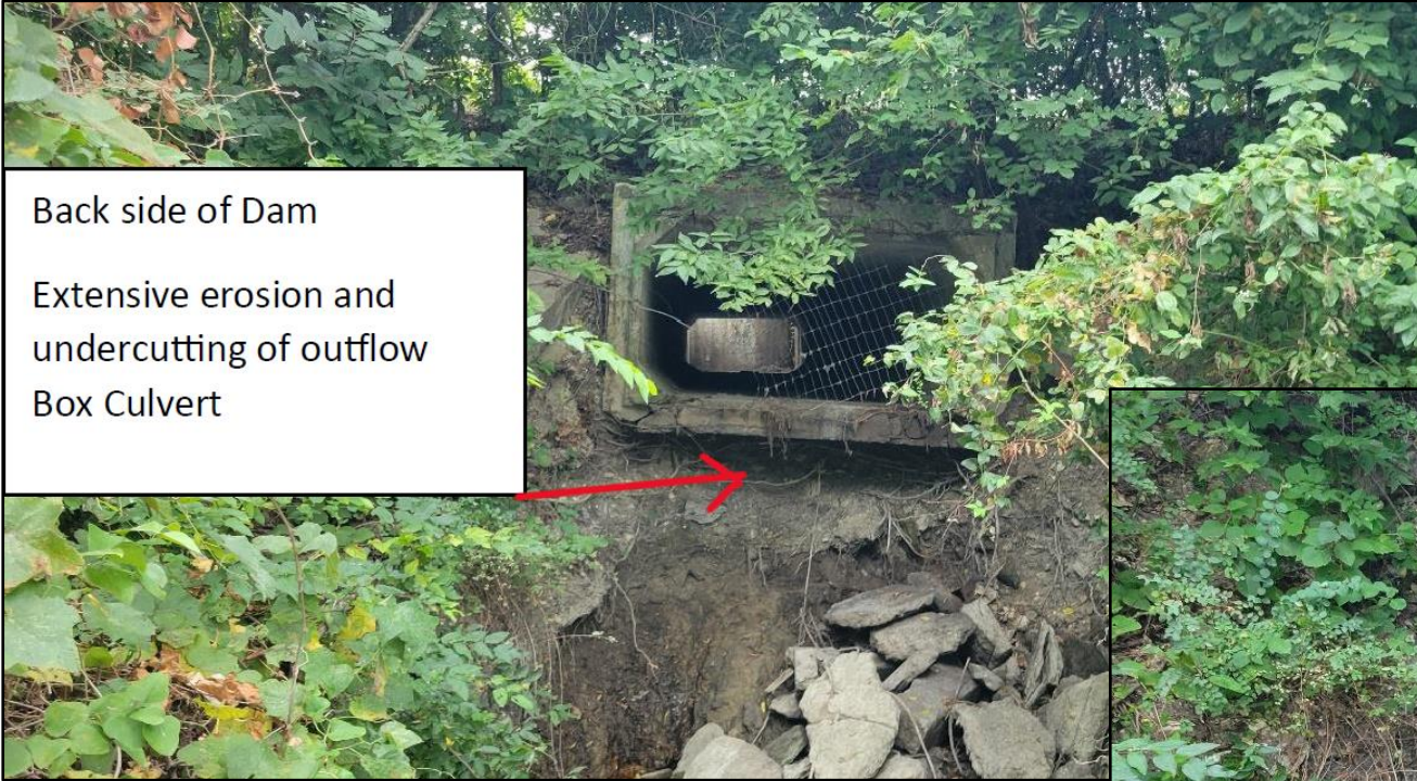
Back side of Dam at outflow Signs of Seepage through dam

Extensive erosion and undercutting of outflow Box Culvert