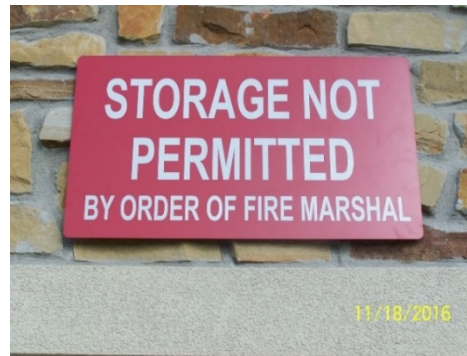
Storage Prohibited Signs