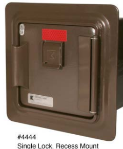
Knox Vault 4400 Series for Up to 35 Keys