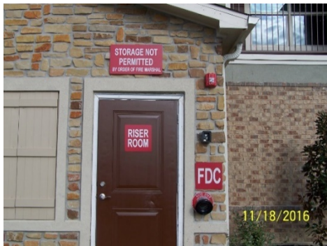
Riser/FACP Room Signage