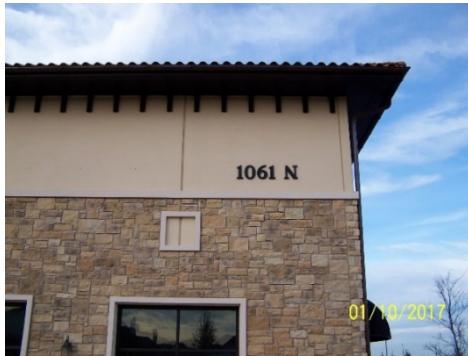
Address seen from the street @ posted speed