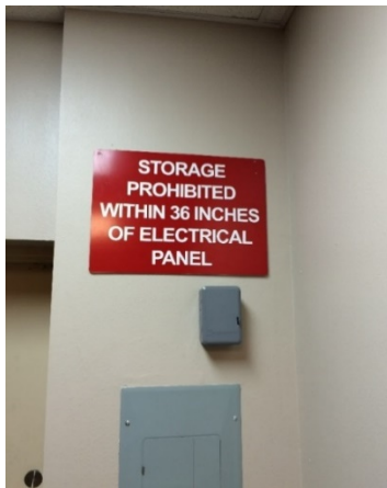
Obstruction of Electrical Panels