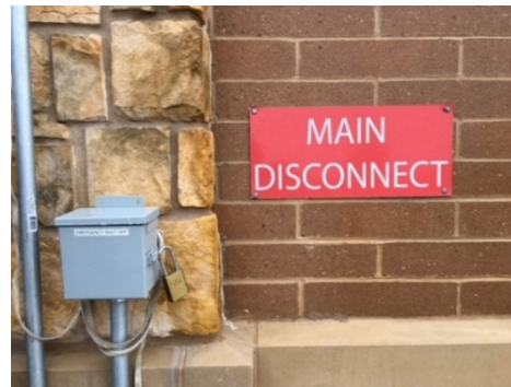
Utility Disconnect Signs