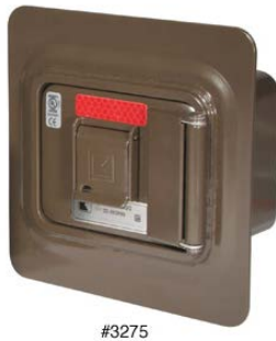
Knox Box 3200 Series for Up to (6) Keys

The Key Vault/Box shall be sized to conveniently accommodate the maximum number of keys as established for locking requirements by the property owner and/or tenants. Vault/Box shall be recessed type with hinge