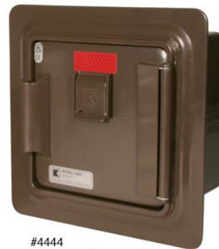
#4444 Single Lock, Recess Mount

Knox Vault 4400 Series for Up to 35 Keys