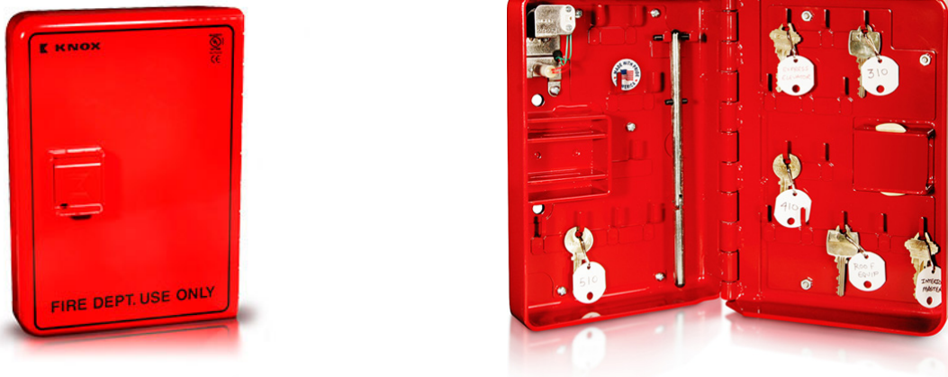
Knox 1400 Series with Door Drop Key & Key Storage

The Knox - Emergency Access Cabinet to be installed in each elevator lobby on the first floor, 6 feet to the top of the box above finished grade.