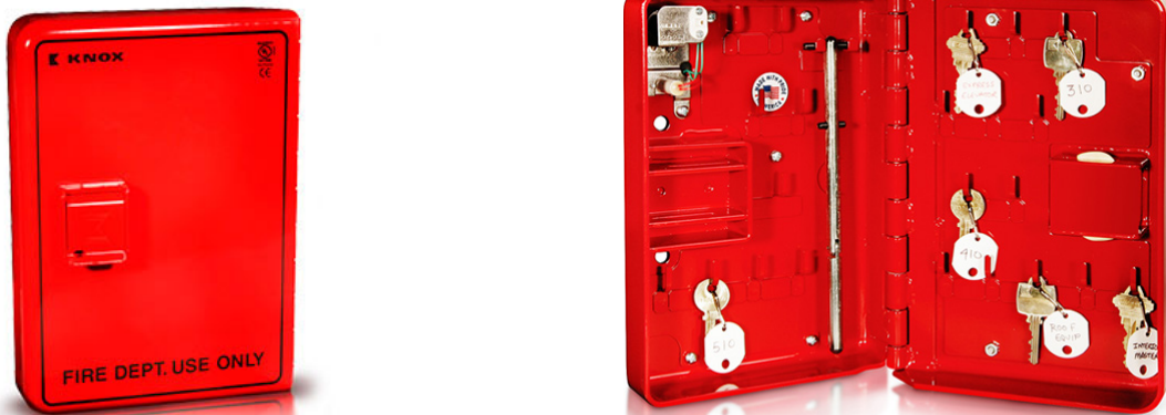
Knox 1400 Series with Door Drop Key & Key Storage

The Knox - Emergency Access Cabinet to be installed in each elevator lobby on the first floor, 6 feet to the top of the box above finished grade.