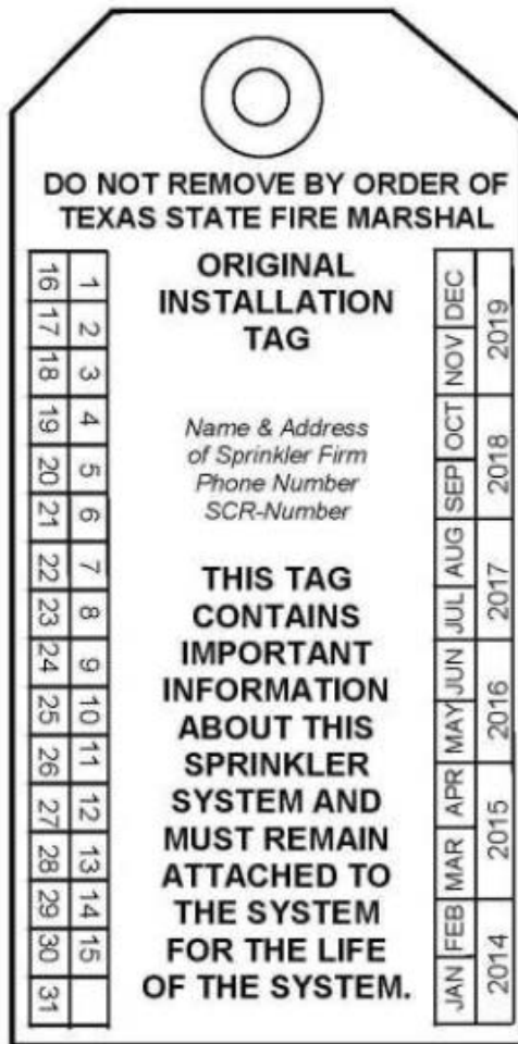
Figure 28: TAC §34.718(h)