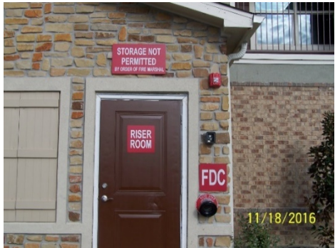
Riser/FACP Room Signage