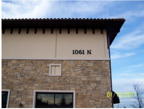
Address seen from the street @ posted speed